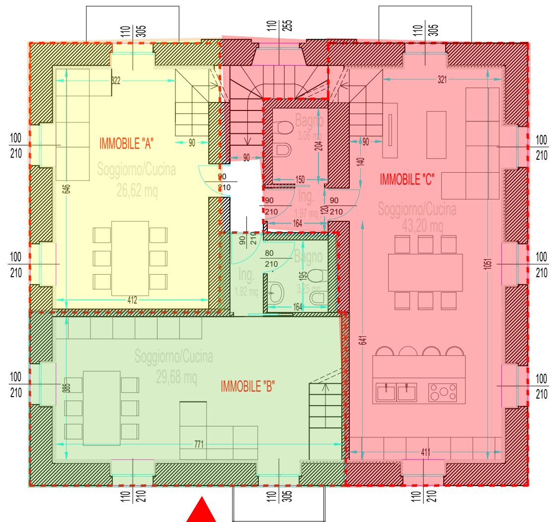
PIANTA PIANO PRIMO